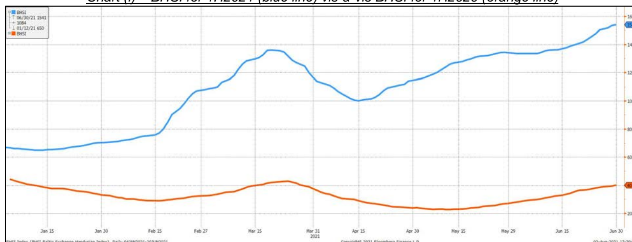
Chart (i) – BHSI for 1H2021 (blue line) vis-à-vis BHSI for 1H2020 (orange line)

Following a disappointing year in 2020 as a result of the COVID-19 pandemic, the shipping market bounced back strongly in 1H2021 due to various factors including increased cross-border trade (increasing demand) and port congestion (decreasing supply). While the Baltic Handysize Index ("BHSI") never crossed the level of 700 for the whole of 2020, BHSI averaged 1,084 for 1H2021. As can be seen from Chart (i) below, BHSI for 1H2021 (blue line) performed much better than that in 1H2020 (orange line). The Group's wholly-owned dry bulk ships had benefited from the strong market in 1H2021.